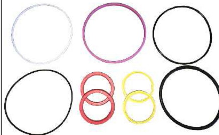
D73060HKS-1 Seal Kit