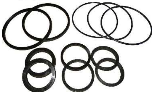
D73060-1 Seal Kit