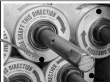
Industries Best Built Roller

"Tarp replacement time is dramatically reduced with the O'Brian roller line."