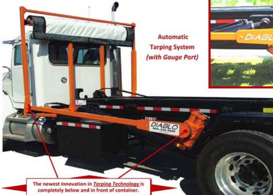
Automatic Tarping System (with Gauge Port)

Pivot Point is below the container floor.